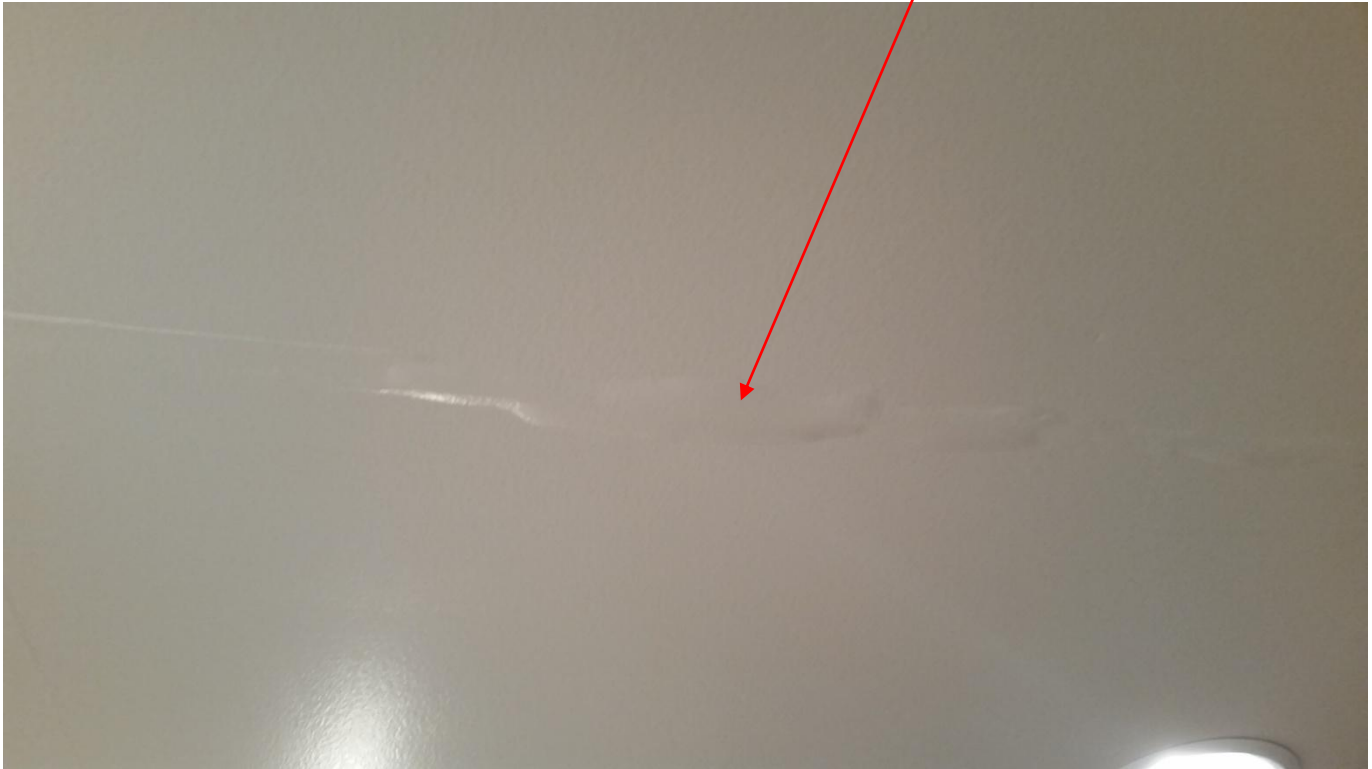
Water-damaged basement ceiling; water-buckled paint along drywall joints

Date Taken: 2/12/2015